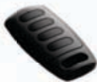
4-Channel Hand Transmitter