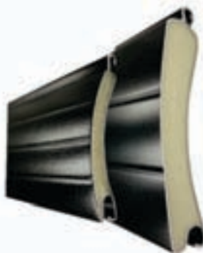
Available in Compact/Classic