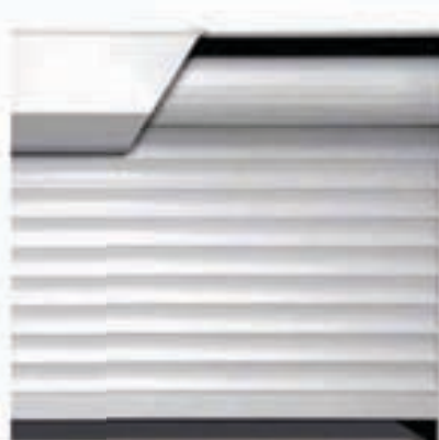
Full or Half Box/Canopy