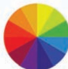
ANY RAL COLOUR

Your door and guides/canopy can be made in any RAL or BS colour as an optional extra.