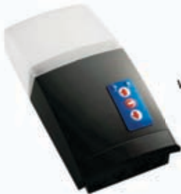
Control Panel with Courtesy Light