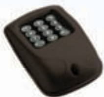
Wireless Key Pad