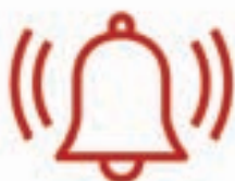
Door Alarm System (98 DECIBELS)