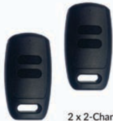
2 x 2-Channel Hand Transmitter