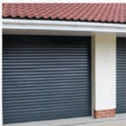
Extensive Solid Colour Range