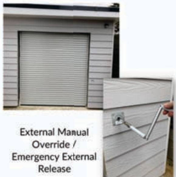
External Manual Override / Emergency External Release