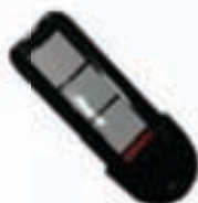
Wall Mounted Remote Controls